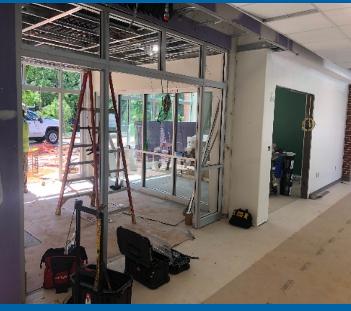
Main Entrance Storefront Installation