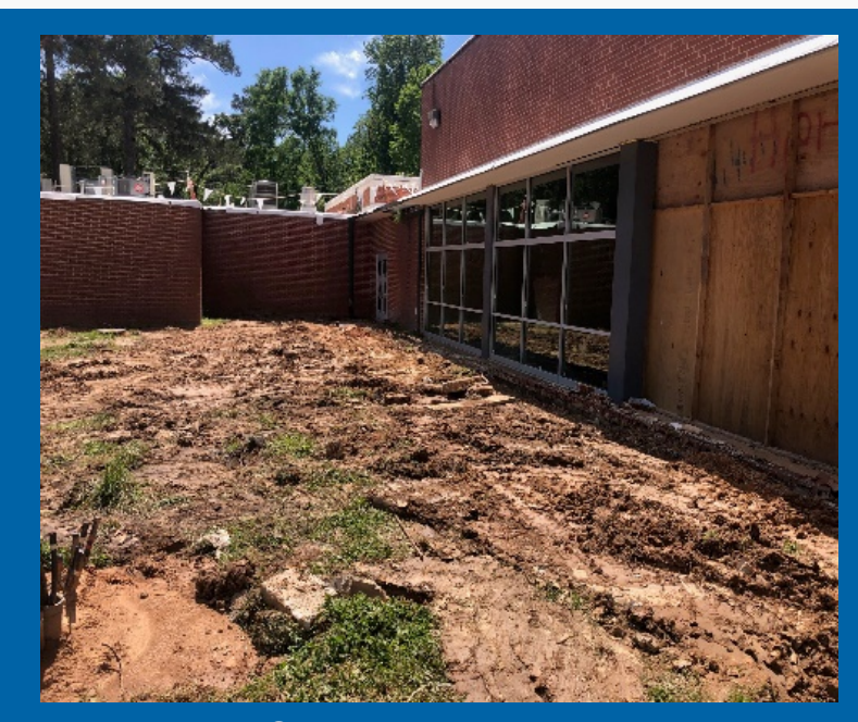
Site demo on-going