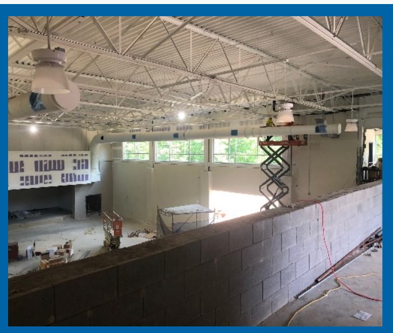
Gymnasium Light Fixture Installation