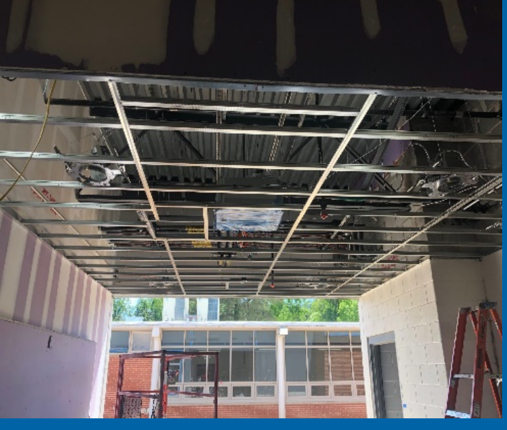
Gymnasium Hard Ceilings and MEP Rough