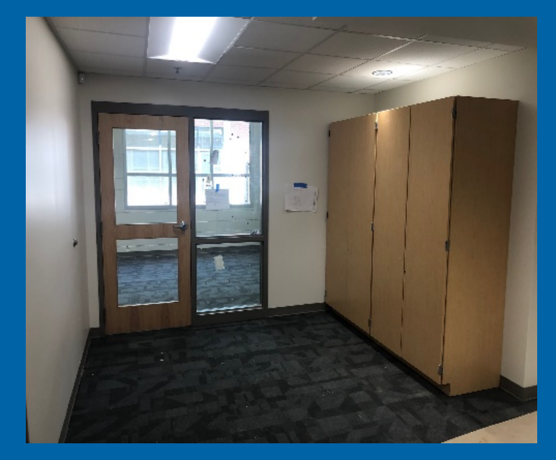
Admin Area Door, Hardware, and Casework